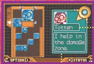
Cyber Elf in Use Cyber Elf Description

Cyber Elf is the program created to help Zero in dire straits. Copies of Cyber Elf are hidden somewhere in a stage for Zero to find. Sometimes they mysteriously appear when certain conditions are met.